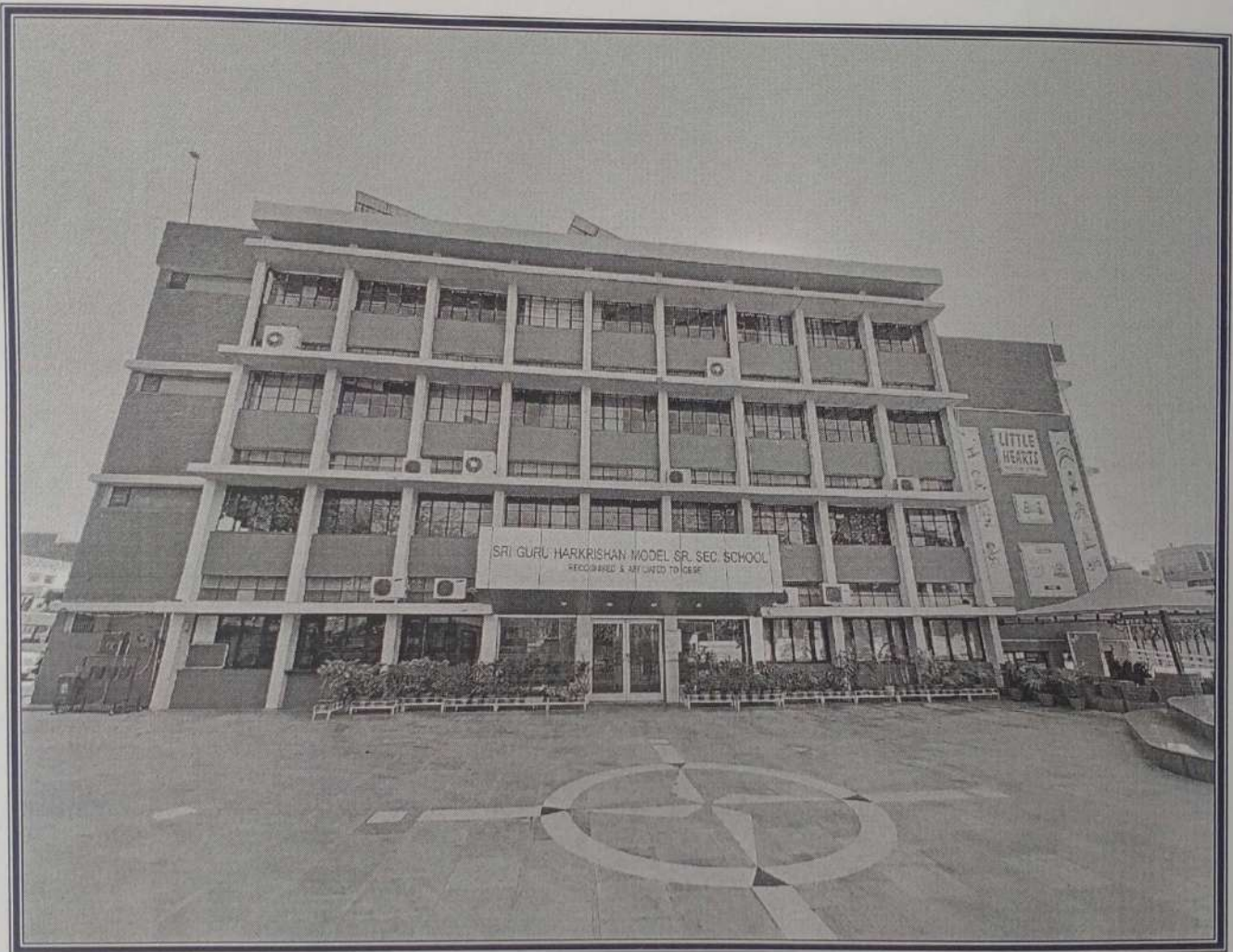
PICTURE OF SRI GURU HARKRISHAN MODEL SENIOR SECONDARY SCHOOL, SECTOR: 38D, CHANDIGARH.